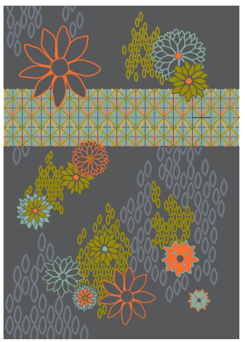
CINDER 1. W454