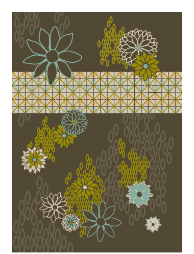
6. W454 CINDER